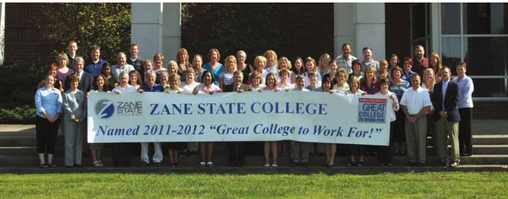
Employees marked the occasion of being named a "Great College to Work For" with a photo at the Zanesville campus.