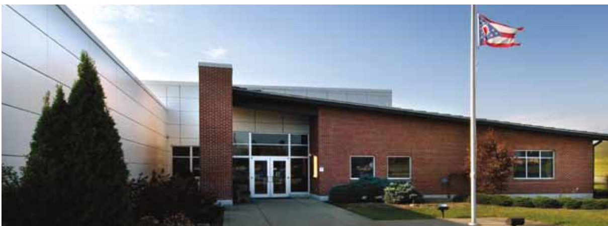
The Willett-Pratt Training Center is the first building on the Cambridge Campus.