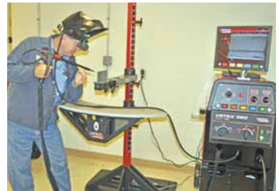
The VRTEX 360 virtual welding simulator allows new students to practice exact welding positions.

“The development of the Marcellus and Utica Shales, along with a pending loss of industry employees due to retirements, will require a tremendous increase in trained workers.”