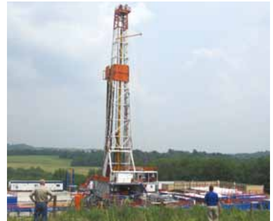
Students will be educated in the new drilling technology coming to southeast Ohio.

“The new training equipment—including a learning system for solar thermal training—enables students to have hands-on experiences with real-world examples,” said Durfee, who is spearheading the College’s energy initiatives. “This type of equipment is extremely effective in preparing workers to meet employer needs.”